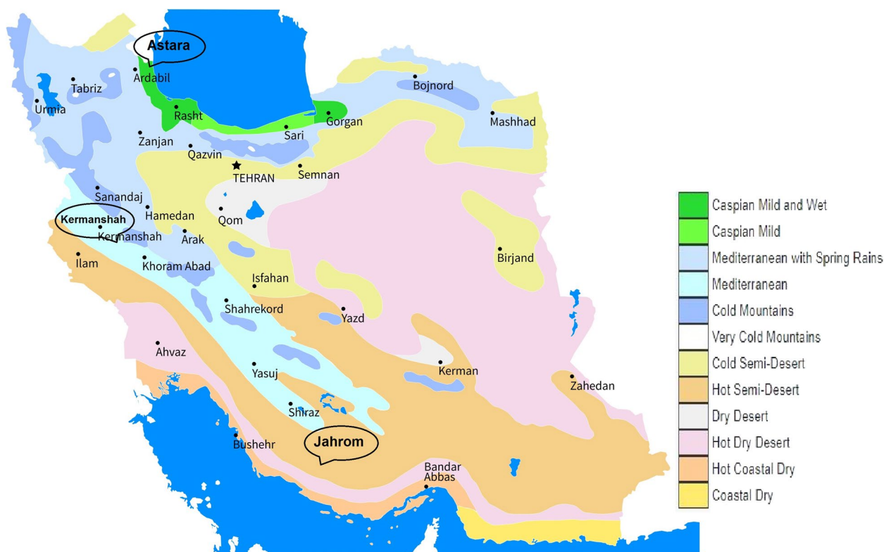
Fig. 1 The climate map of Iran. https://commons.wikimedia.org/w/index.php?title=File:Iran-climate.png&oldid=224111575 . The samples were taken from Astara (north of Iran, border of Caspian Sea), Kermanshah province in western Iran, and Jahrom in nearly south of Iran. Astara: Coordinates: 38°25'45"N 48°52'19"E. Astara county has a humid subtropical climate with relatively cold, wet winters and hot, humid summers. This county has an average rainfall of 1292.5 mm per year, average rainy days ( \geq 1.0 mm) of 112 days, and average relative humidity (%) of 82% ( https://en.wikipedia.org/wiki/Astara,_Iran ). Kermanshah province: Coordinates: 34°18'51"N 47°03'54"E. Kermanshah classified as Mediterranean climate, experiences rather cold winters and a hot-summer. Kermanshah has an average rainfall of 478.7 mm per year, average rainy days ( \geq 1.0 mm) of 77.3 days, and average relative humidity (%) of 49% ( https://en.wikipedia.org/wiki/Kermanshah ). Jahrom: Coordinates: 28°30'00"N 53°33'38"E. Jahrom county has a hot semi-arid climate. The average rainfall is about 285 mm (11.2 in) per year. The average rainy days ( \geq 1.0 mm) of 27 days, and average relative humidity (%) of 46% ( https://en.wikipedia.org/wiki/Jahrom )